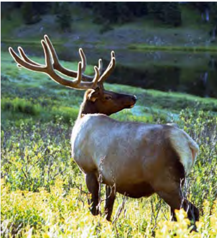
Majestic bull elk in spring velvet.

While current planning efforts still lean towards traditional measures for supplying water, Colorado can chart a new, innovative path forward that protects our rivers, streams, and local communities.