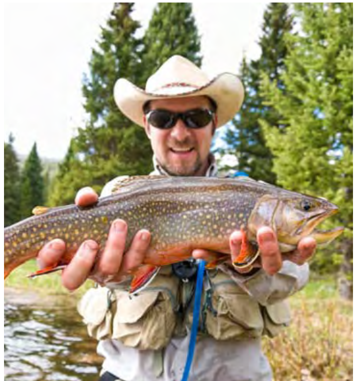
A fine catch.