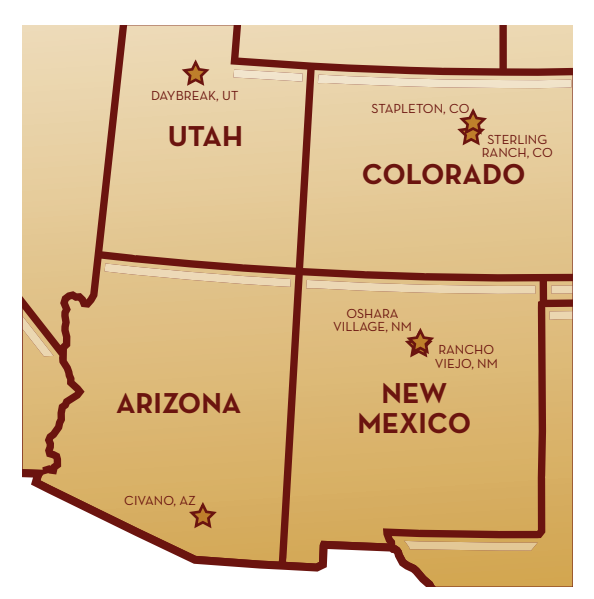
Figure ES-1. Highlighted water-smart developments in the Interior West.

Living water-smart requires common-sense approaches to using water wisely, and can be employed by any resident, whether or not they live in a community that was planned and built water-smart. Education plays a vital role in bringing knowledge to homeowners. Whether this education is presented in the form