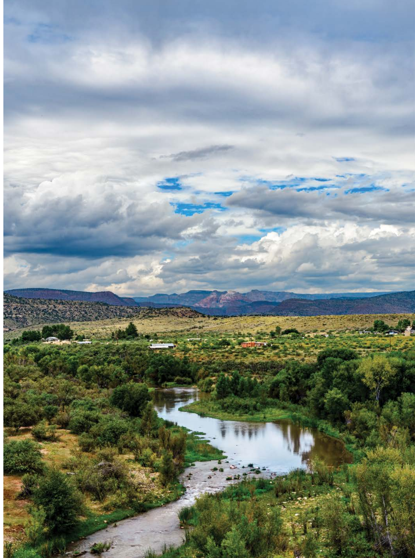
Opposite page: A small stream in rural Arizona, where water users such as farmers and ranchers could leverage the new law for the benefit of the river.

Commonsense water solutions can unite us and protect the rivers that embody the West. State-level leadership on conservation remains essential, and we cannot slow down. As a trusted thought leader, WRA is making progress in state legislatures and with state agencies across our region to protect our treasured rivers, streams, and watersheds. That is a positive change worth celebrating.