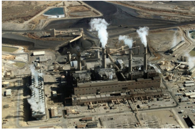
The San Juan Generating Station coal-fired power plant in the Four Corners region of New Mexico has provided energy for New Mexico since the 1970s. When it was fully operating, the plant emitted 13 million tons of carbon dioxide a year, making it one of the largest sources of pollution in the region.

As the ETA is implemented, its benefits will grow. "It will mean a big paradigm shift," O'Connell said. "It will accelerate the move toward renewable energy."