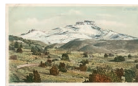
Investing in state and even neighborhood parks, like Colorado's brand new Fishers Peak State Park, ensures protection for irreplaceable wildlife habitat while also providing more ways for people to get outside.