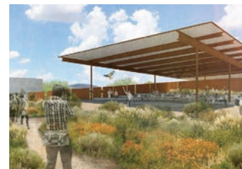
All communities must share in the benefits of protecting land and waters. Albuquerque's Valle de Oro, the first urban national wildlife refuge in the Southwest, is an oasis for waterbirds and a living lab for area school kids. Valle de Oro: Collaborative rendering by Weddle Gilmore, Surroundings Studio, and Formative Architecture.