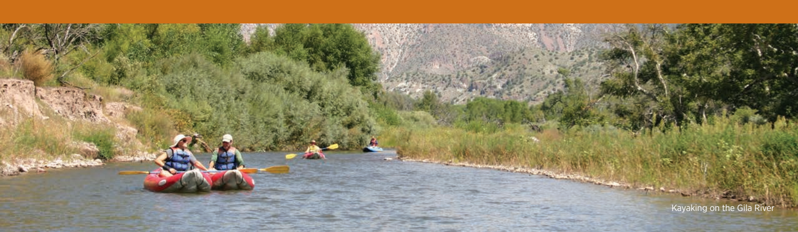
Kayaking on the Gila River

Local city and county elected officials have tapped just over $2.5 million of the $66 million available for community water needs. Our water alternative identifies more than $33 million dollars of water conservation and efficiency projects that would meet Deming’s future water needs.