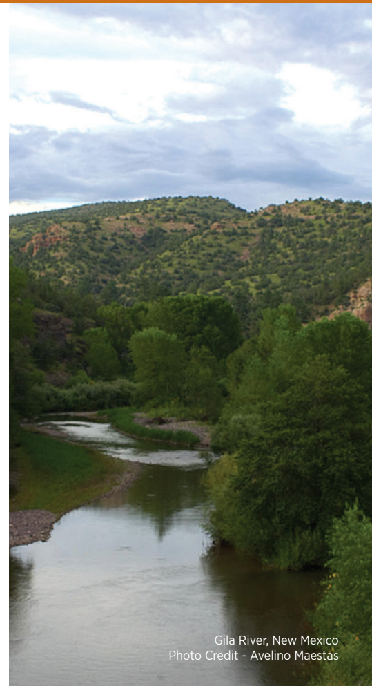
Gila River, New Mexico

This shovel-ready water alternative would create jobs and position Deming and Luna County as an attractive and water-secure hub for new businesses in arid southwestern New Mexico.