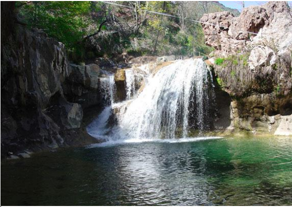
Fossil Creek.

From Fossil Springs, Fossil Creek flows southwest, primarily through national forest lands – including several designated wilderness areas – and forms the boundary between Gila and Yavapai Counties. The creek’s channel runs through a gradually widening canyon, and joins the Verde River approximately 20 miles southeast of Camp Verde.