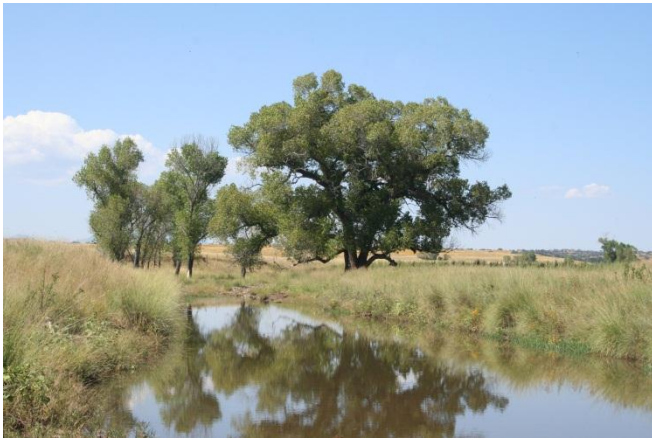
The Santa Cruz River near its headwaters in the San Rafael Valley.

(“A Mountain”) near downtown Tucson. Today, due to groundwater pumping, the springs and cienegas are dry and the river flows through downtown Tucson only during storms.