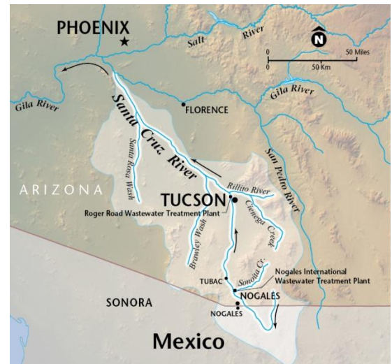
Top image: Watershed of the Santa Cruz River in relation to other Arizona rivers. Bottom image: Detail of the Santa Cruz River watershed.